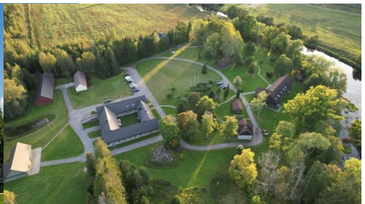
Särghaua Earth Science Centre