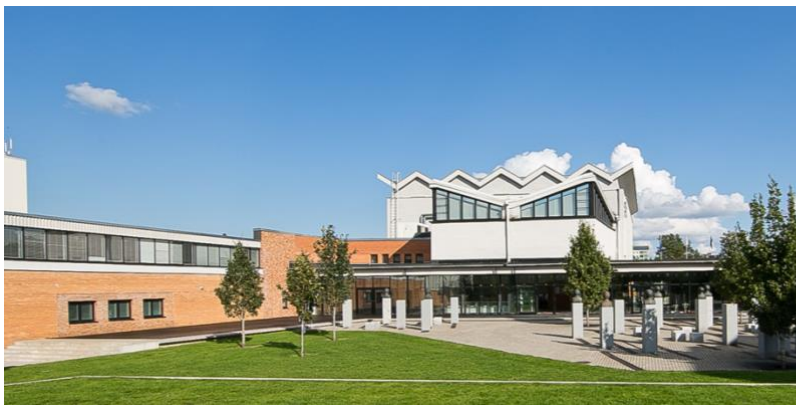
Tallinn University of Technology

This four-day workshop provides an introduction to diatoms with a focus on their relevance in forensic investigations. The programme combines lectures, hands-on sampling, practical workshops, and field activities, offering participants both theoretical knowledge and applied experience in a natural setting.